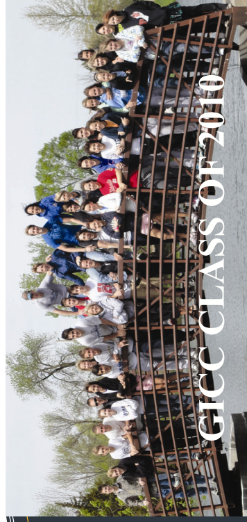
GICC CLASS OF 2010

Your gift of $1,200 a year ($100 monthly) or more will fill the need we experience this year.